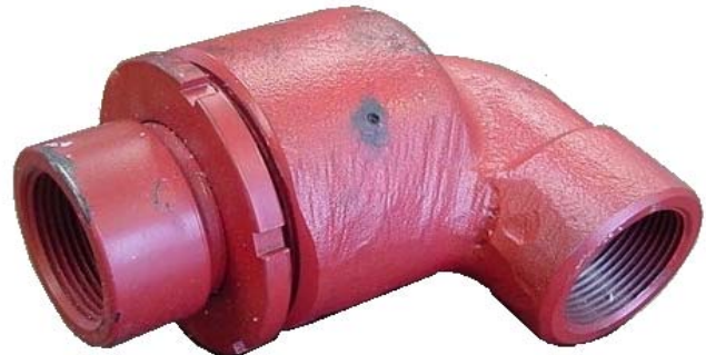
NEW STYLE 1 1/4" REEL SWIVEL PART NO. A130727-1