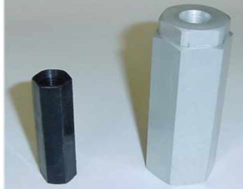
Photo showing the difference in size between part no. A110079 (left) and A249366 (right).