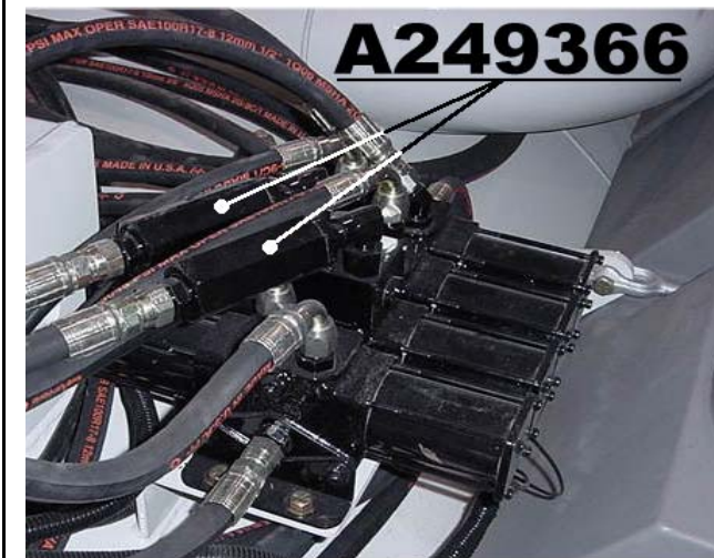
Photo showing the location of part no. A249366 in the early flow control valves.