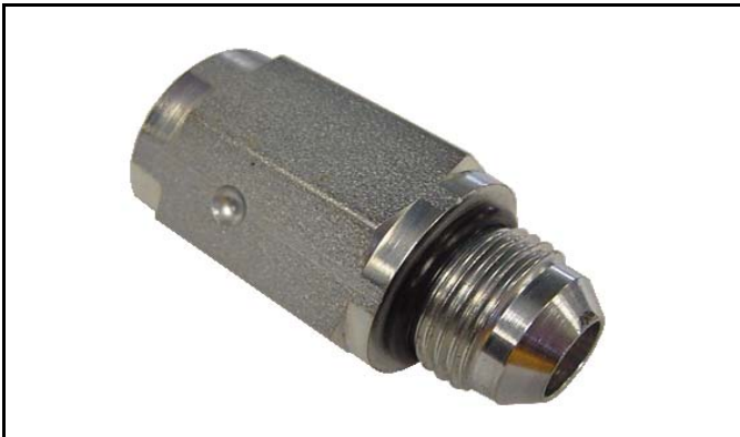
Photo of the earlier (and still available) A110078. It screwed vertically into the control valve.

On B-Series and SJR units with rear reels there are two in-line valves, one on each hydraulic hose going from the four spool hydraulic valve to the reel articulation hydraulic actuator. The purpose of these valves is to slow down the reel articulation (in and out swing) to a safe speed. Older models use part no. A110078 "Line Throttle Valve" and more recent models use part number A110079 "Pressure Compensated Flow Control Valve". A110079 has been superseded by part no. A249366. A249366 is physically larger than it's predecessor, but the thread sizes are the same. Please use this bulletin as a supplement to the hydraulic section of your manuals.