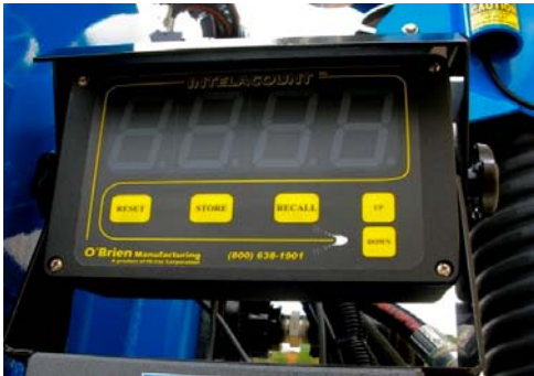
Front of OBJ-2430K Intel-A-Count™ Unit

This parts bulletin is being supplied to provide parts identification and retro-fit information for the Intel-A-Count™ electronic footage counter.