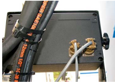
Rear of OBJ-2430K Intel-A-Count™ Unit