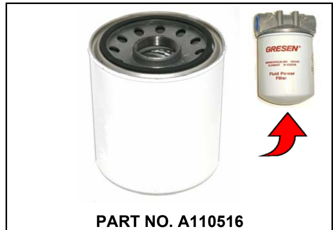
Spin-on suction hydraulic filter. Located near the outlet of the hydraulic reservoir right after the gate valve and prior to the hydraulic pump. This is the primary filter for the hydraulic system