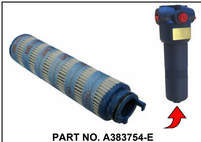
Replacement high pressure hydraulic filter element. Filter housing is located after the hydraulic pump and is mounted to the power deck. We started using this filter in early 2009.